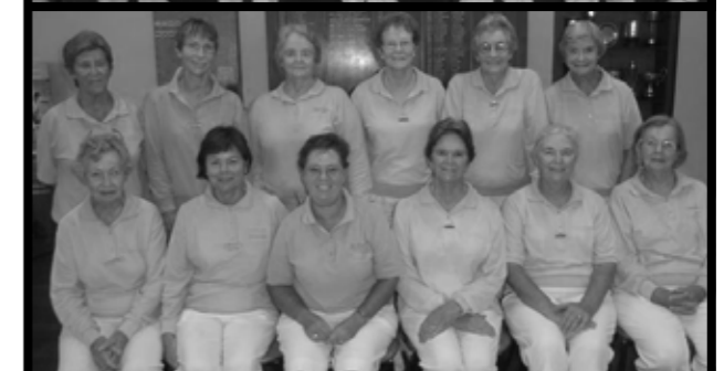
Ladies 3rd Promoted