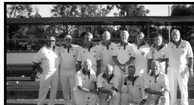
Thursday 2 Gold Pennant Winners

Besides that team we have Thursday 2 Gold and Saturday 4 Purple and 5 Red all winning their pennants the last two promotion. The ladies had a great year topping both 3 Green and 4 Purple to be both promoted.