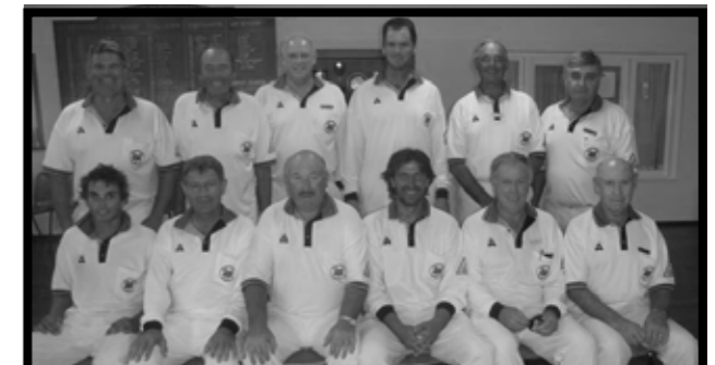
Thursday 1 White Promoted