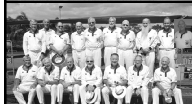
Saturday 4 Purple Pennant Winners