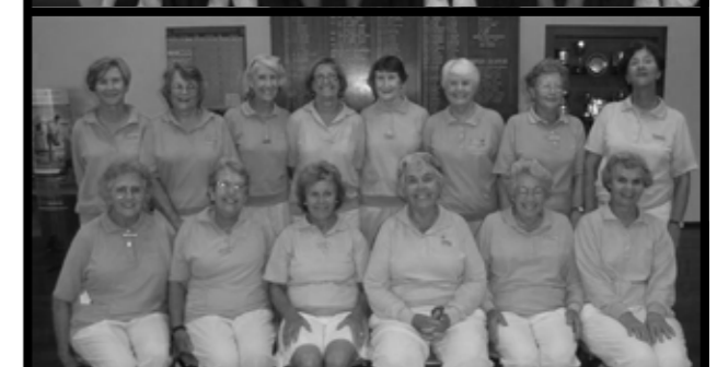
Ladies 4th Promoted

ANNUAL GENERAL MEETING FRIDAY 25TH MAY 5.00pm All members male and female are invited to attend