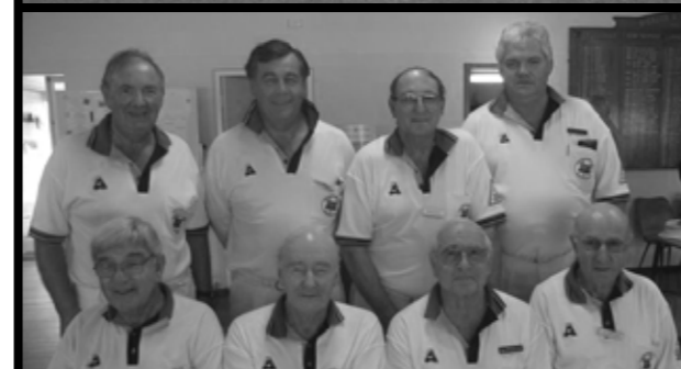
Saturday 5 Red Pennant Winners